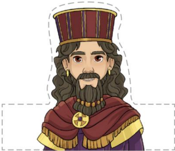
The King of Babylon